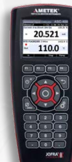
ASC300 ASC301 ASC321 ASC-400 ASC-400 BARO