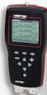
HPC500 HPC502 HPC600

When combined with these JOFRA calibrators, the APM is a powerful calibration tool.